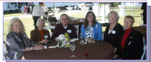
Some BHSP Members That Attended The Fundraiser

Preservation North Carolina depends on the generous donations of its 5000 members to sustain their preservation efforts. The organization was instrumental in helping get BHSP off the ground and to where it is today.