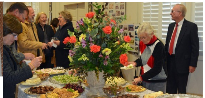
Members & Guests enjoying Reception following Dedication ceremony